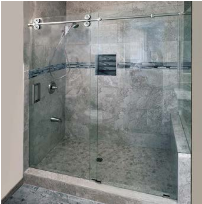
Door Handle Not Included

The circular shaped Header and the round Rollers of the Crescent Series Sliding Door System are the perfect complement to each other. They help provide a luxurious sliding shower door system and also a soft décor. The use of minimal hardware lends itself to the popular modern sliding shower door systems by showing more glass, and less hardware. The high quality Rollers assure quiet door travel, and make the door easy to slide. The Crescent Series Sliding System accommodates 1/2" or 3/8" (12 or 10 mm) thick tempered safety glass (not included), and the system allows that the fixed and sliding panels are reversible for installation as desired. The Crescent Series Sliding Door System is available in a choice of polished stainless steel, brushed stainless steel, or the new popular matte black finish.