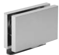
ESS3 Square Corner Roller Style