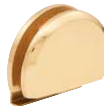
ESS1 Rounded Roller Style