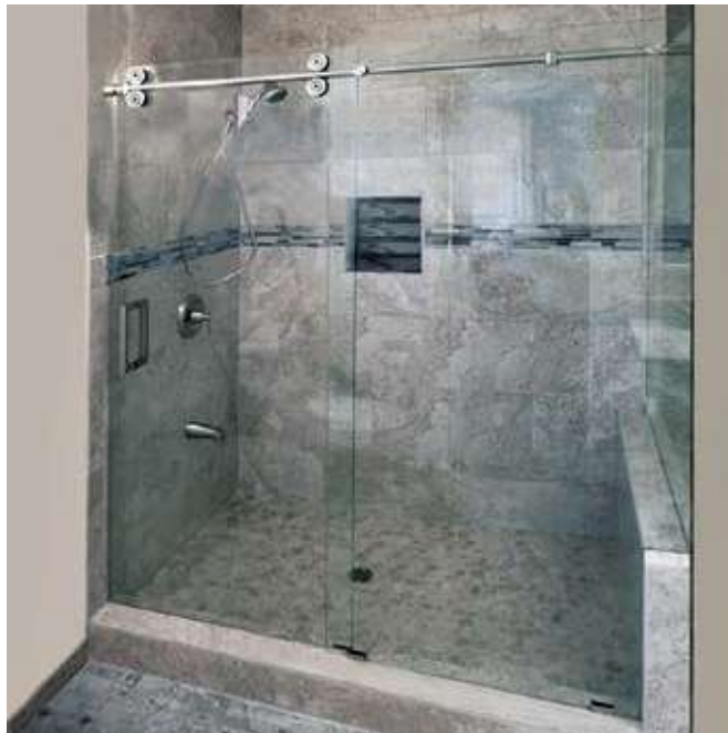
Door Handle Not Included