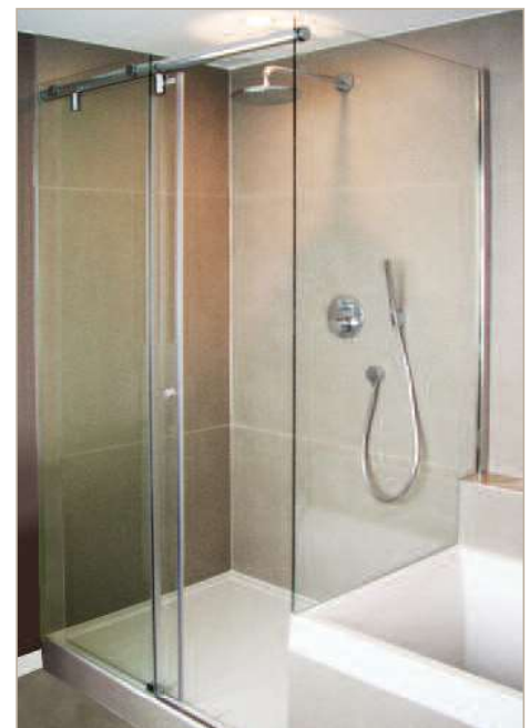
90 Degree Wall-to-Glass Installation Uses our 180 Degree Standard Kit plus a 90 degree Wall-to-Glass Accessory Kit