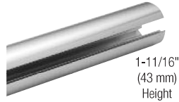
1-11/16" (43 mm) Height

The extruded aluminum Sliding Shower Door Upper Track is available in two lengths and four finishes. You can easily cut to length for your installation. Longer lengths available on special order.