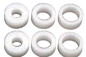
CAT. NO. HYDS

A White Bushing Spacer Pack is included in each Hydroslide Sliding Shower Door Kit, but this replacement pack is available if needed. Two each of three different sizes are used to help fill the holes drilled in glass and prevent slippage. Six per pack.