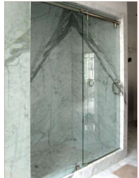
180 Degree Wall-to-Wall Installation Uses our 180 Degree Standard Kit

NOTE: Bottom Fixed Glass Attachments, Handles or Knobs must be ordered separately.