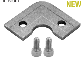
CAT. NO. HYDH90

To be used when two Hydroslide doors come together in a 90 degree corner. NOTE: Sliding panels not to exceed 17" (432 mm) in width.